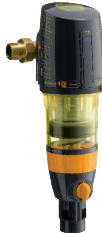
DRUFI+ DFR Backwash filter with pressure reducing valve