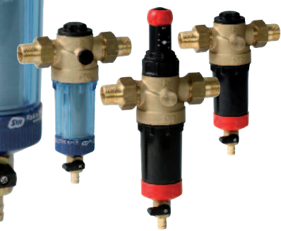
RATIO Compact backwash filter with high flow rate, suitable for apartments as well as private houses