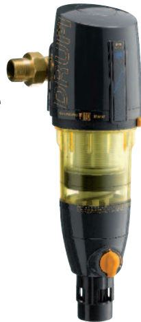
DRUFI+ FR Backwash filter