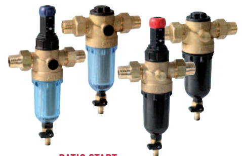
RATIO START Compact flush-out filter, ideal for apartments