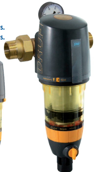
DRUFI+ max Admissible service pressure of 16 bar